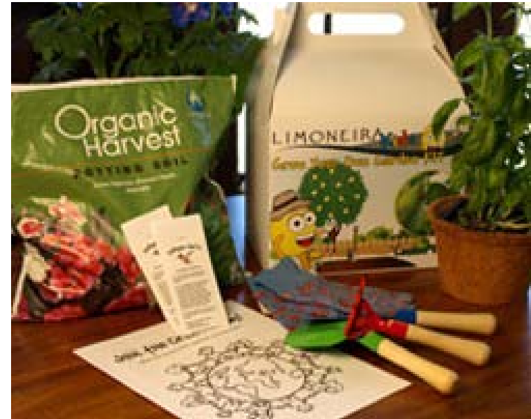
Master Gardening Kit- Growing Sustainably