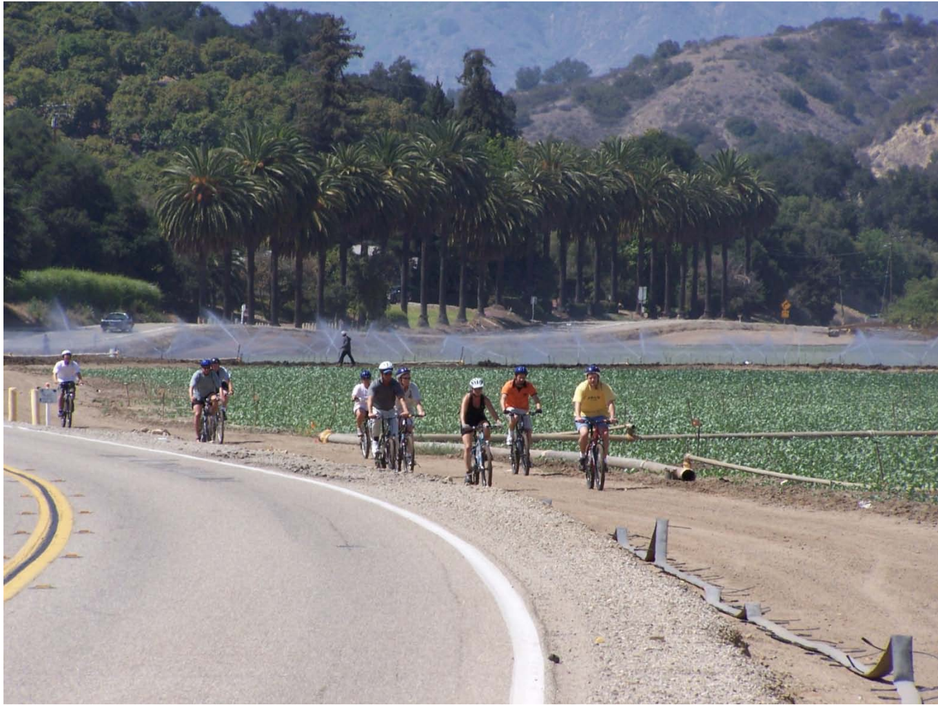
Miles of back county roads provide great biking opportunities.