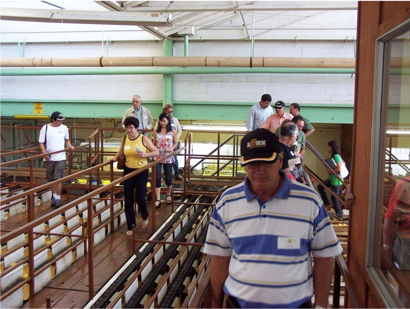
Visitors on the Lemon Packing House Tour.