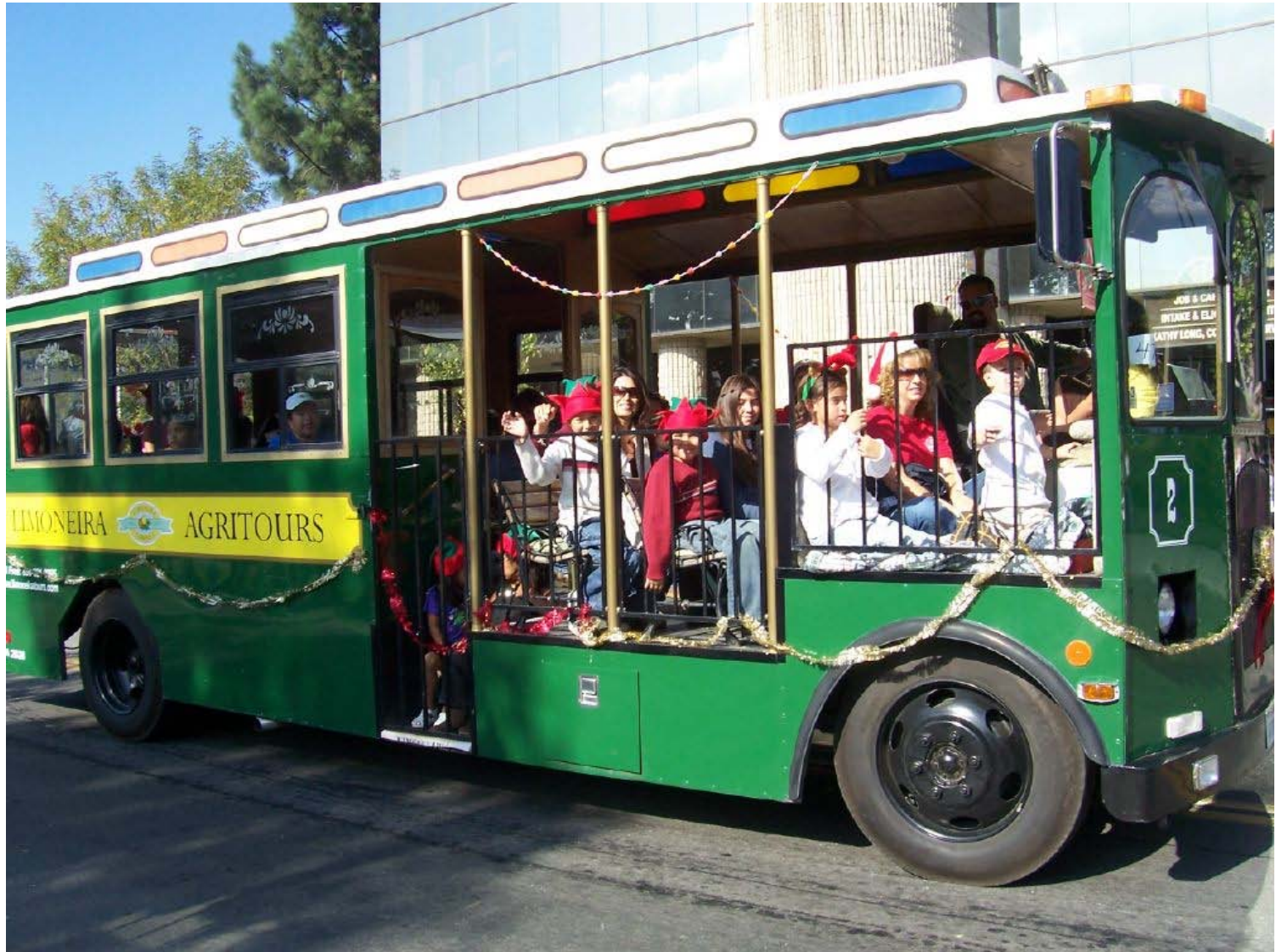
The old Limoneira trolley transports visitors around the ranch.