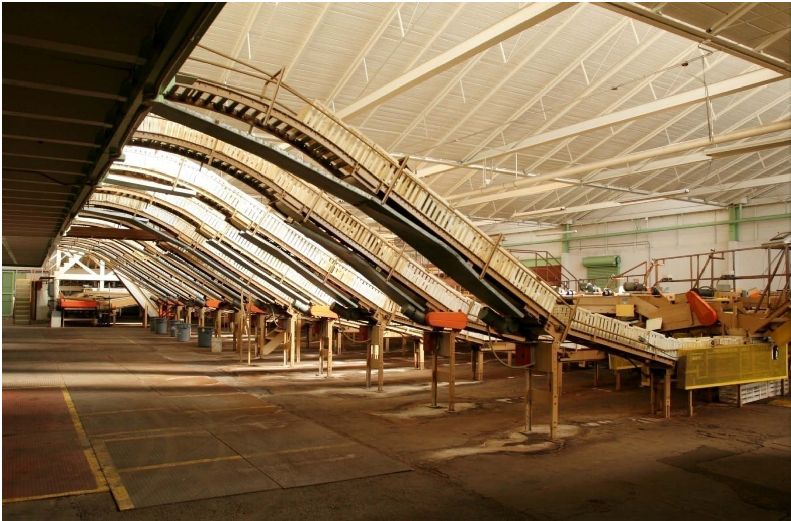
Cartons of fruit are transported from the wash station to the optical graders and scanners.