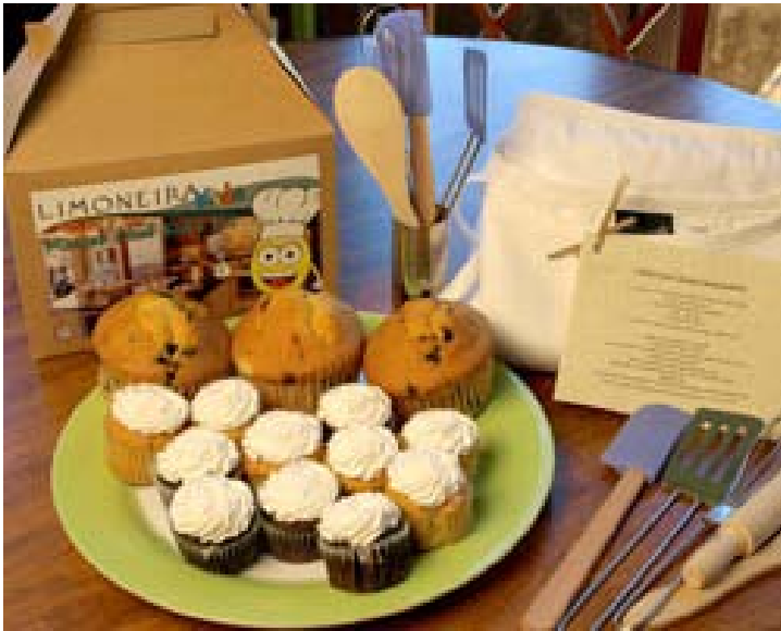
Culinary Kit- Fun and nutritious recipes