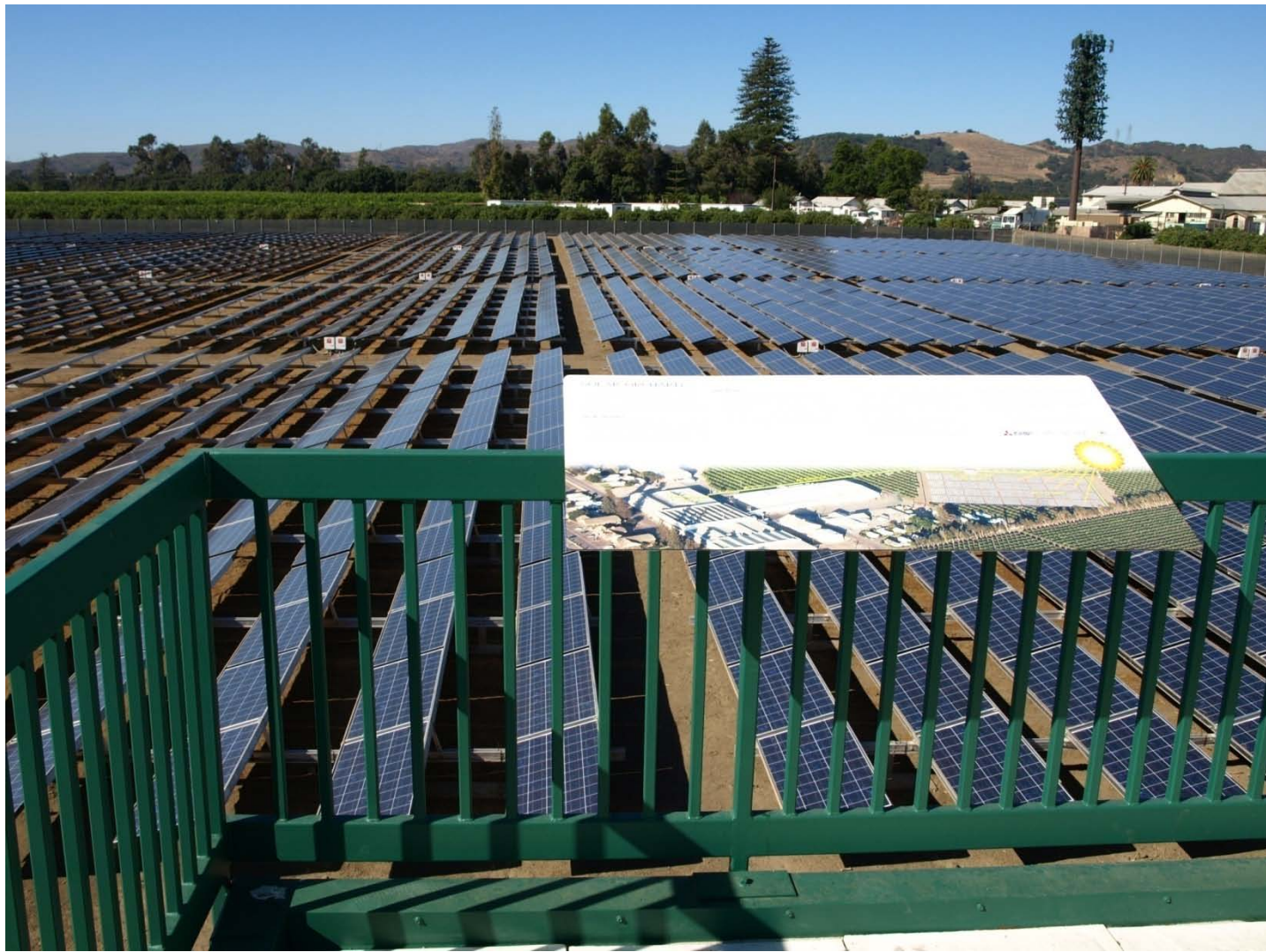
6400 photovoltaic panels make up the solar array.