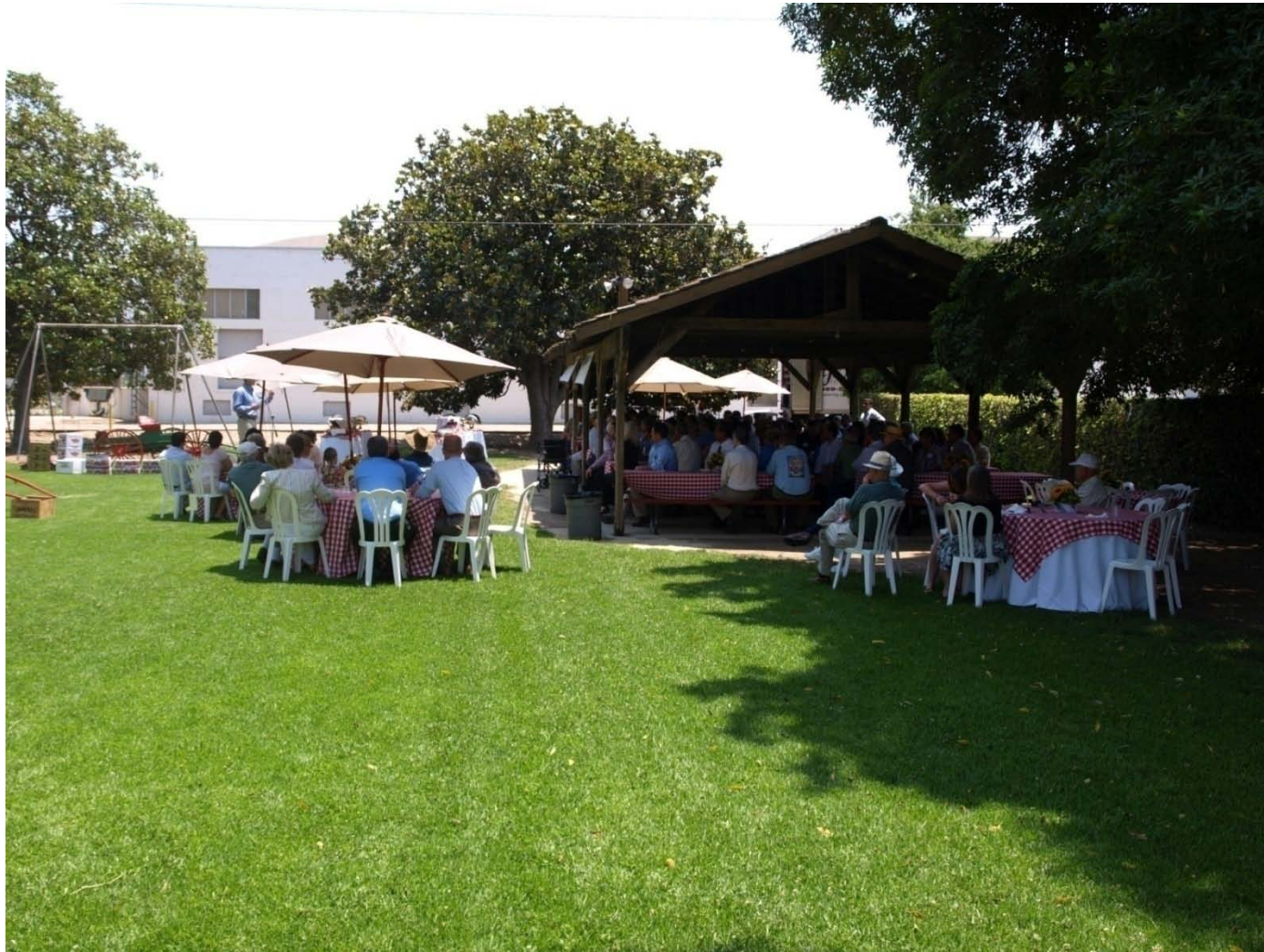
Limoneira Park is the perfect place for great BBQ's and casual dining.