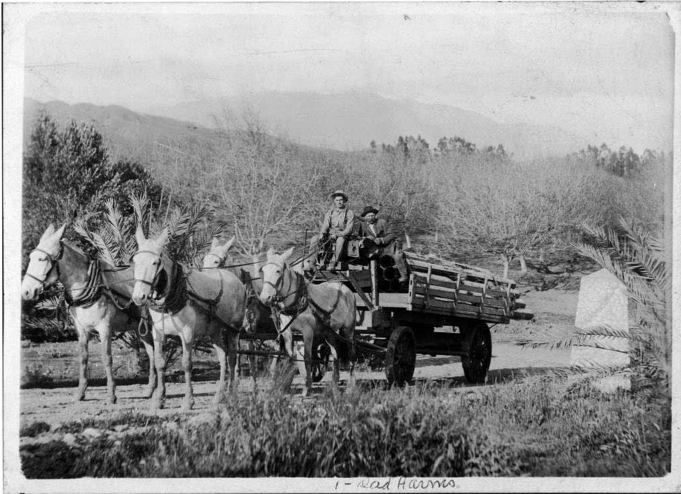
1 - road Harris

Prior to widespread truck utilization, mules were used on the ranch to transport products to the trains for further distribution to far away markets. Limoneira has a large collection of historical photos for visitors to view.