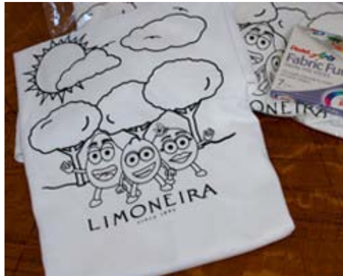
Kid's Fun Coloring T-Shirts